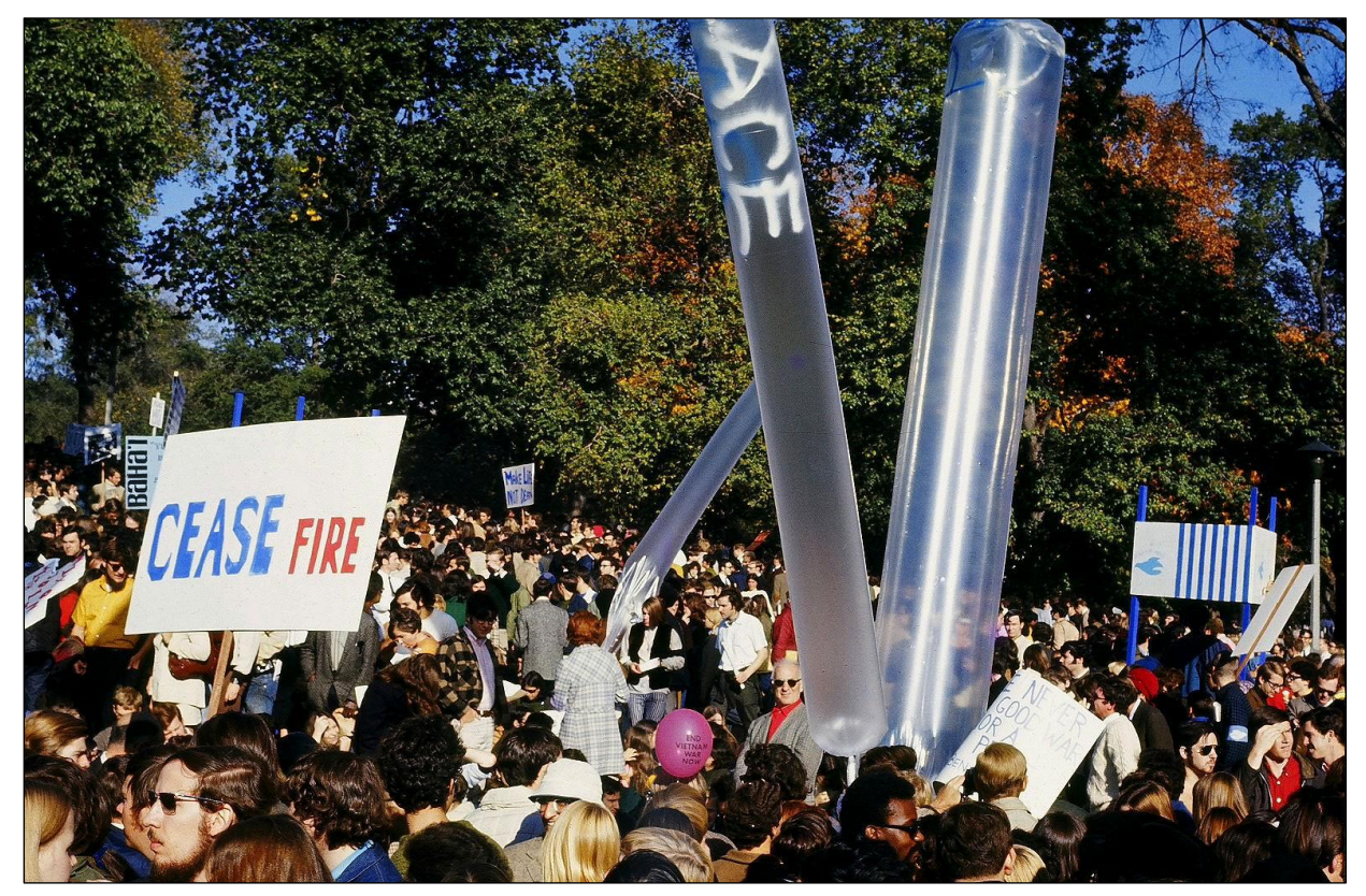
October 1969 protest on the Boston Common.

1968, the year that the Beatles released their White Album, was a pivotal year in US history. About 500,000 US troops were in Vietnam and the war showed no sign of winding down. The majority of Americans were against the war, and the number and size of protests were increasing dramatically. The draft (conscription) that was initiated in 1947 was still in place, and it put young men's lives on hold as they were drafted in increasing numbers to meet the need for military personnel in Vietnam. One could get a deferment while in college, but as soon as one graduated he was eligible for the draft.